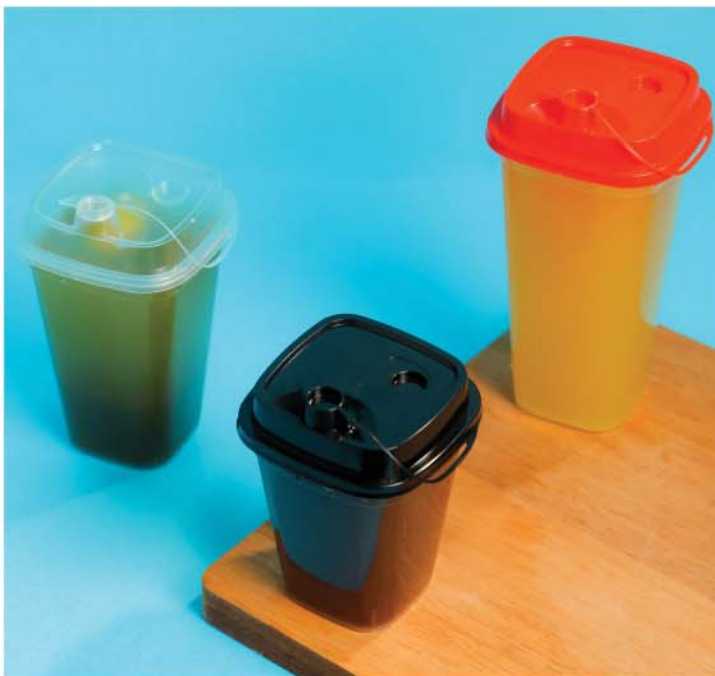
200ml, 350ml, 500ml SQUARE SIPPER GLASS