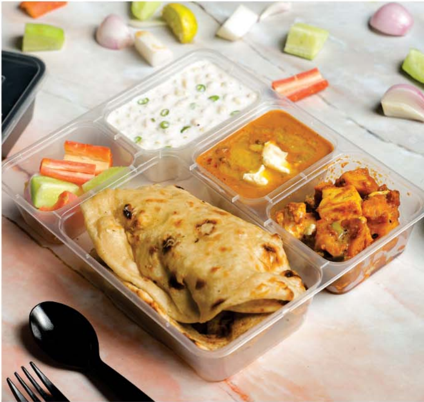
5CP MEAL TRAY