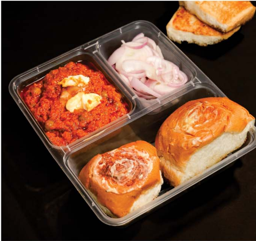
3CP MEAL TRAY