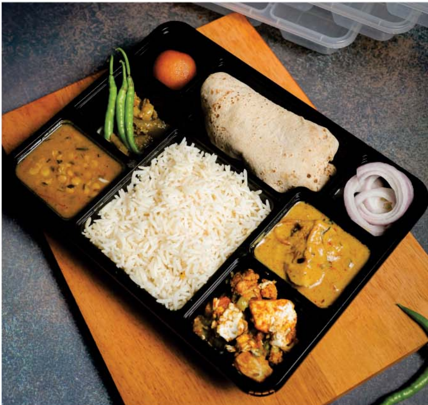
TAMPER PROOF 8CP MEAL TRAY