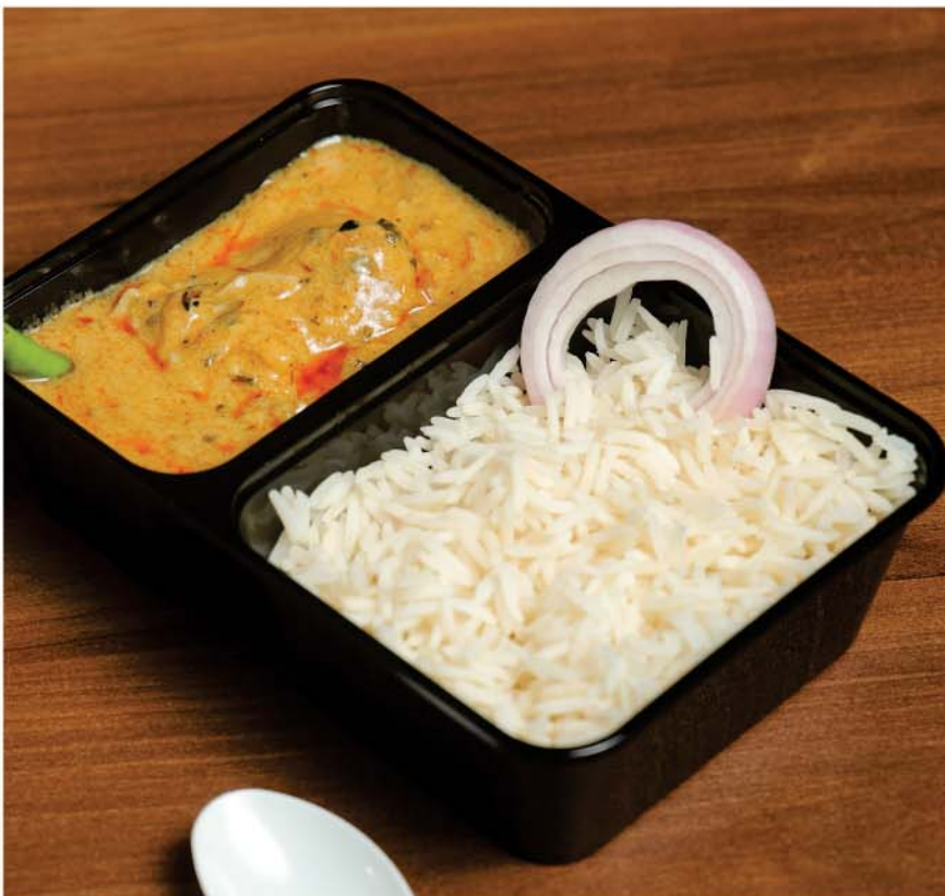
2CP MEAL TRAY