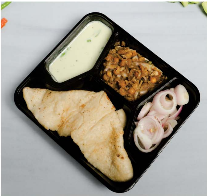
4CP MEAL TRAY