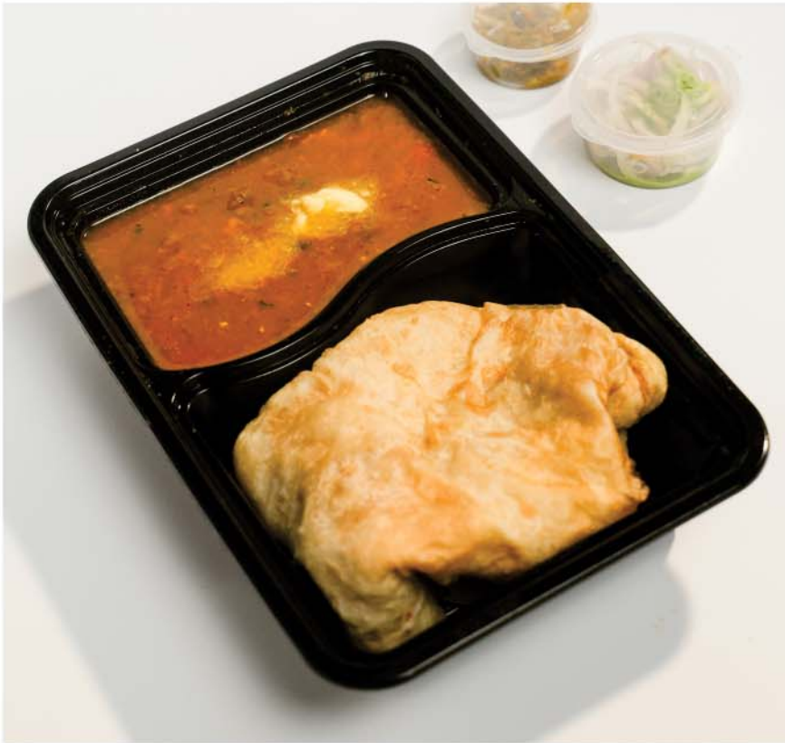
RE 2CP MEAL TRAY