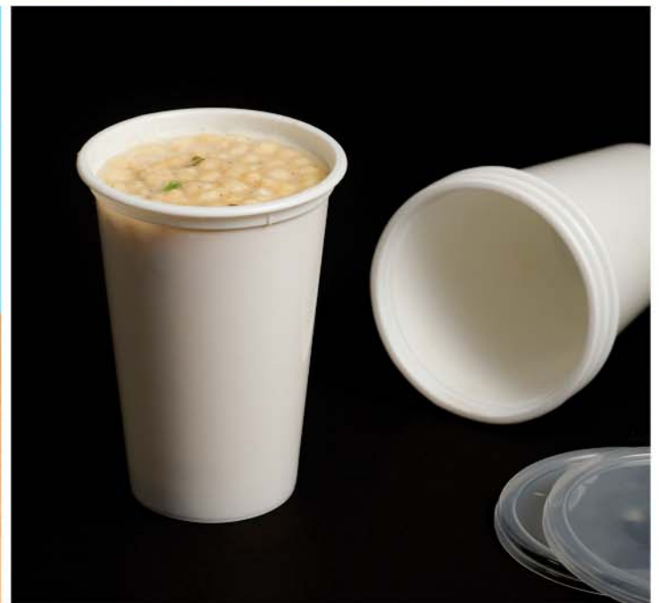
300 ml MILK GLASS