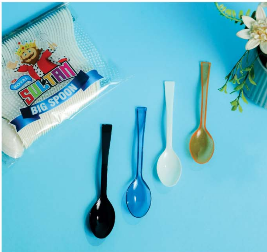
SULTAN BIG SPOON